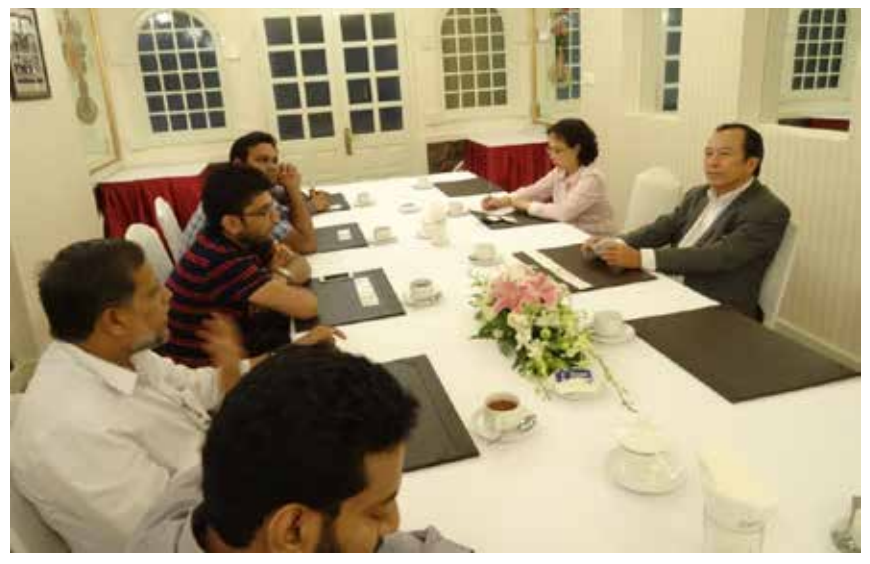
The delegates at the meeting

leather segment. In this connection, Indian finished leather exporters can participate in the Shoes and Leather Exhibition held every year in Ho Chi Minh City (next edition is scheduled between July 15-17, 2015) by having an India Pavilion, so as to create awareness on the Indian finished leather industry.