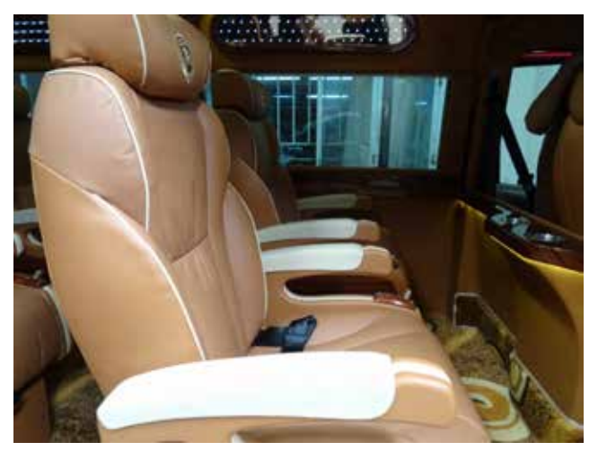
Upholstery Leather used in Van Seating