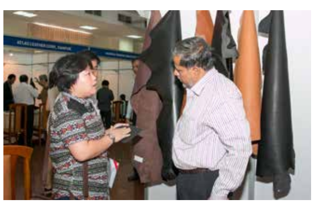
SUNRISE OVERSEAS, KANPUR