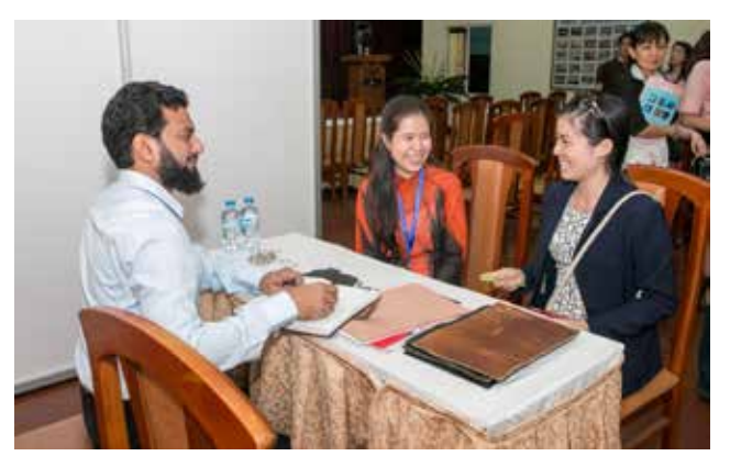
HOMERA TANNING INDUSTRIES, KANPUR