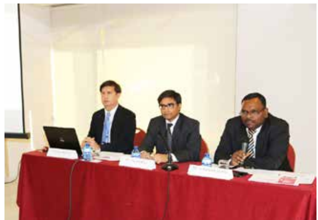
ED-CLE addressing the Press Meet

As the Council is organizing the 19th International Technical Footwear Congress of UITIC - International Union of Shoe Industry Technicians in India during February 03-05, 2016, the Council is undertaking wide publicity campaign in all its overseas fair participations and Buyer seller meets through international press meets. Accordingly with the help of the marketing agency M/s Seven SM Events y Marketing, a press conference was organized inviting the local press officials on 11th March in the same venue at Hotel Melia Avenida America, Madrid after the inaugural ceremony of the India Leather Show.