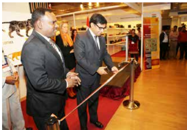
H.E. Shri Vikram Misri, IFS, Ambassador, Embassy of India, Spain inaugurating the Show

Speaking on the occasion, the Ambassador highlighted the importance of the Indian leather sector in the Indian economy and its growth potential. The Ambassador em-