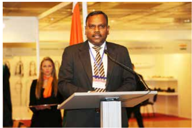
ED, CLE addressing the audience at the show

The Executive Director in his speech, highlighted the market potential of Spain and the growing trend of India's exports to Spain from 2009 to 2013. He further stated that Spain ranks 40th in value terms of bilateral trade with India, among all countries of the world, and featuring above