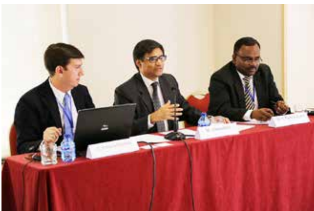
Ambassador addressing the Press Meet