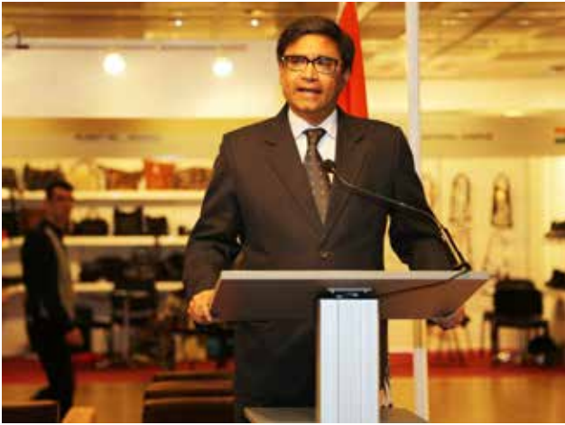
Ambassador delivering the inaugural speech

phasized on its inherent strength and the need for the upgradation in the tanning technology to combat the environmental problems. The Government of India's 'Make in India' programme will give a new turn to the development of the Indian leather sector.