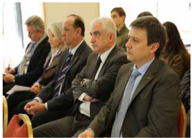
Press Officials in the Press Meet