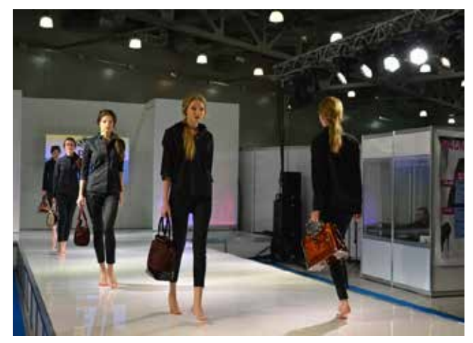
Glimpses of Fashion Show during 59th MosShoes, Moscow

SEMINAR & PRESENTATIONS: The exhibition offered many interesting features i.e. the Forum "Business promotion in internet", Seminars of the German Footwear institute, Seminars on topics namely "How to choose a franchise for yourself? The basic rules and errors", "Footwear assortment optimization or How to increase the