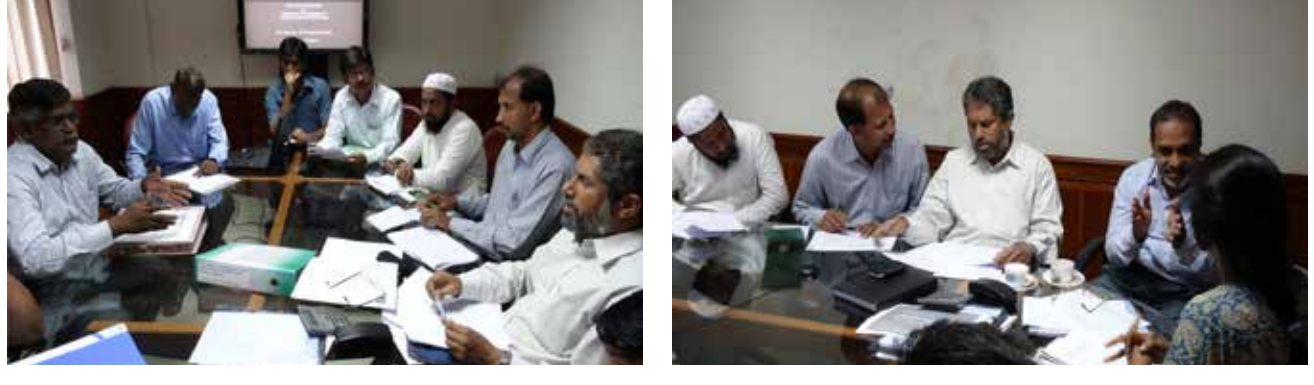
Southern Region, Open House Meet held on 03rd Oct 2013