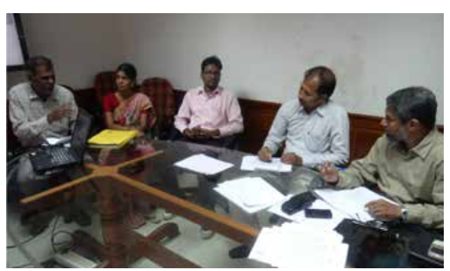
A participant raising a query