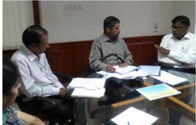
A participant raising a query