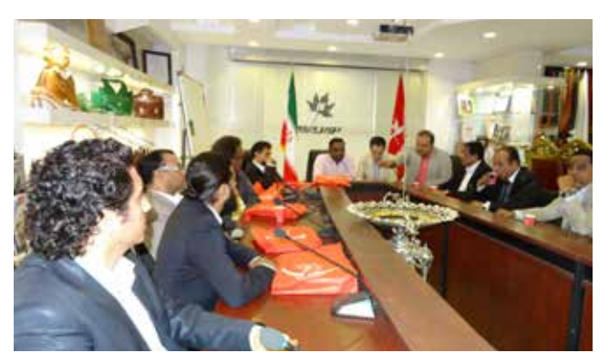
Press Meet at the factory