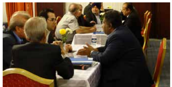
A view of the business meetings