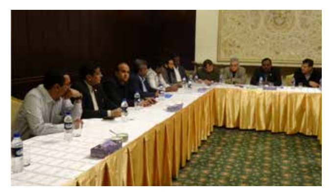
Indian Participants at the meeting

Meeting with the Office Bearers & Members of Iran Pickled Skin Leather Producers Exporters Association, Iran