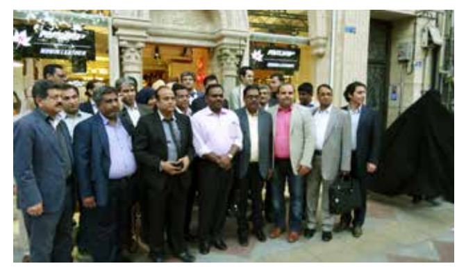
Delegates at the factory