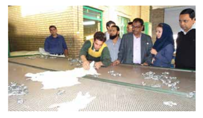
Participants having a look at the Ostrich leather manufactured in one of the tanneries

Meeting with the Office Bearers & Members of Iran Pickled Skin Leather Producers Exporters Association, Iran