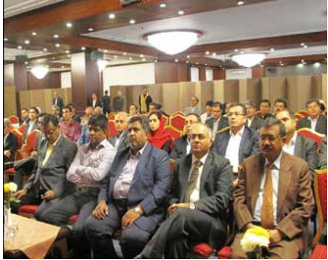
A view of participants at the inaugural session