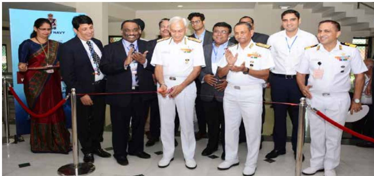
Admiral Sunil Lanba, PVSM, VSM, ADC, Chief of the Naval Staff inaugurating the exhibition

Admiral Sunil Lanba, PVSM, VSM, ADC, Chief of the Naval Staff alongwith other dignitaries inaugurated the Exhibition by ribbon cutting after which the dignitaries visited the stalls.