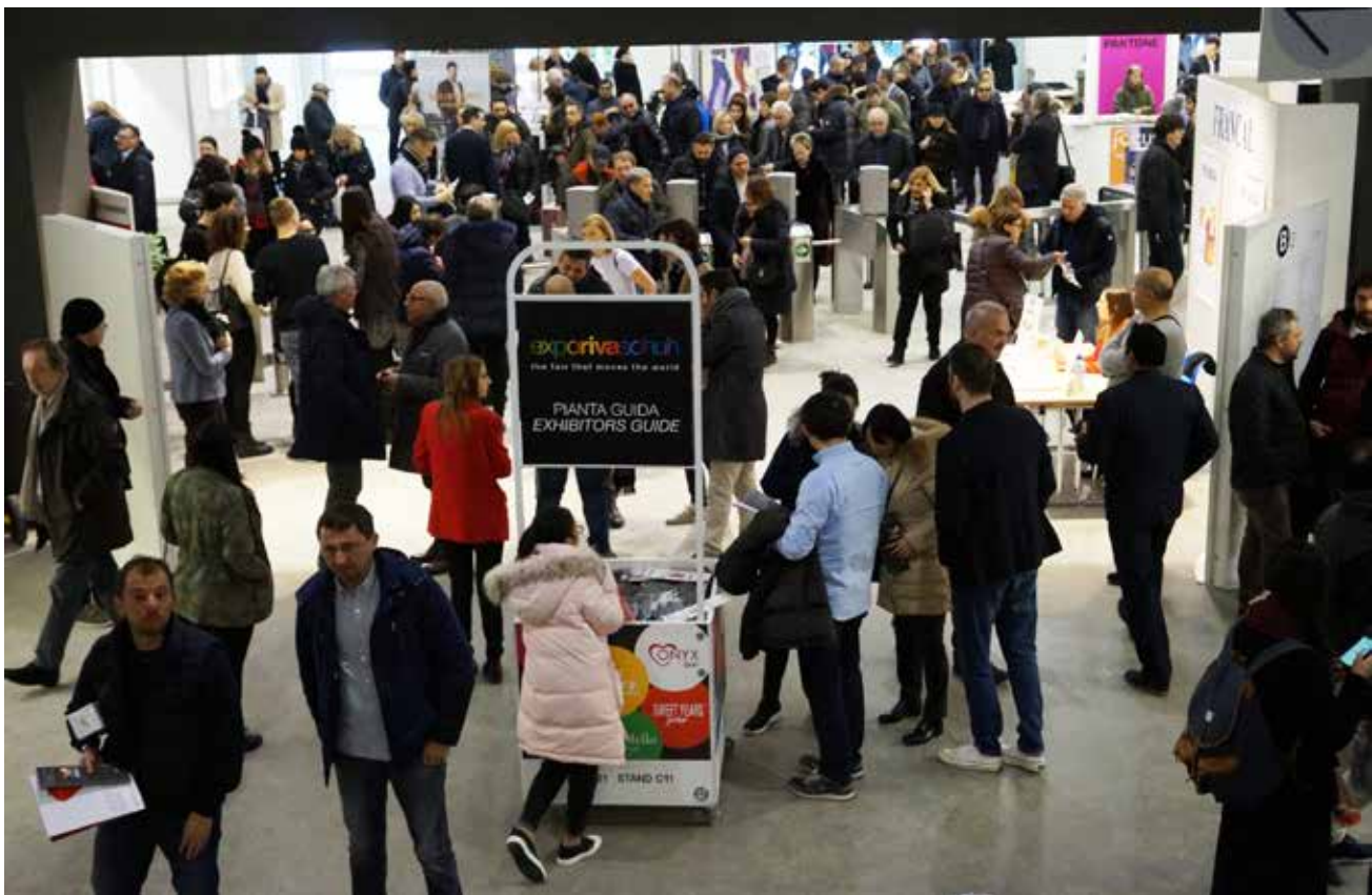
Trade Visitors through the Expo Riva Schuh Fair-A photo