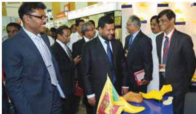
Mr. Rishad Bathiudeen, Hon'ble Minister for Industry and Commerce, Govt. of Sri Lanka interacting with the participants

"Sri Lanka footwear and leather exports in 2016 increased by 28% in comparison to 2015 revenues to $140 Million showing strong growth trends," the Minister said addressing the opening of Sri Lanka's Annual Footwear Leather Exhibition on 3rd Feb at the BMICH in Colombo.