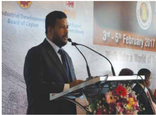
Mr. Rishad Bathiudeen, Hon'ble Minister for Industry and Commerce, Govt. of Sri Lanka speaking at the inauguration of the fair

Sri Lanka's footwear and leather exports have increased by a strong 28 percent in 2016, Hon'ble Minister of Industry and Commerce Mr. Rishad Bathiudeen said at the inauguration of the fair.