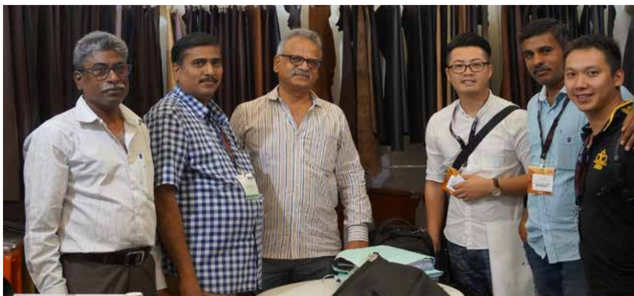
List of Participants & Display Products @ in All China Leather Exhibition under CLE India Pavilion