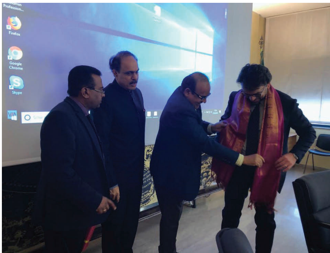
Meeting with Italian Government and Trade Agencies