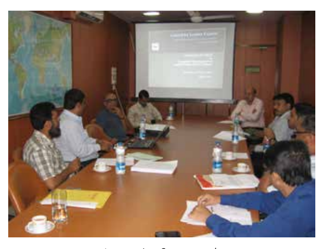
Interaction & case study