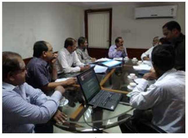
Session under progress