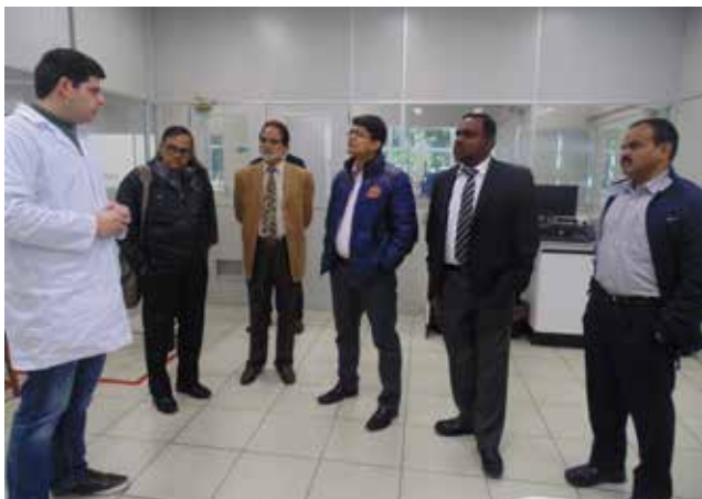
ED, CLE, Consul-Commercial & the Delegates at Senai

The Senai Technological Centre composed of Laboratory for Design of shoes, soles, clothing, bags and packaging, Workshop for cutting CNC (computer) for leather and rolled, Classrooms for courses in technology and design of leather and footwear, Office of leather clothes, Laboratory for finishing leather, Laboratory for chemical tests, physical and biomechanical.