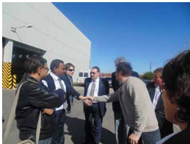
The tannery owner welcoming the delegation

The Curtiembre Angel Giordano tannery was founded in 1954. The tannery which was started as a family enterprise has today grown with sophisticated Italian machineries, producing around 1000 cowhides daily. The tannery is has its own CETP for treating the solids and waste.