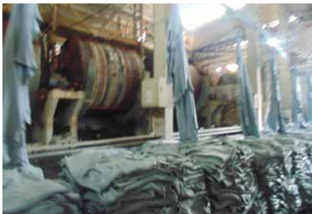
Wetblue in the tannery