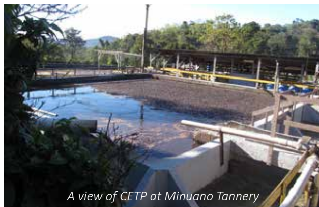
A view of CETP at Minuano Tannery