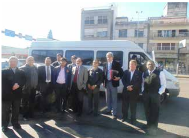
Municipal officials welcoming Indian delegation

The Municipal Officials explained the potential of Argentina Leather industry and currently Argentina is exporting leather to China, Italy, Hong Kong, European countries etc., The tanneries in Argentina are fully mechanized in removing the skins from the animals. Pampa is the region in Buenos Aires, a fertile grassland known for rearing of ani-