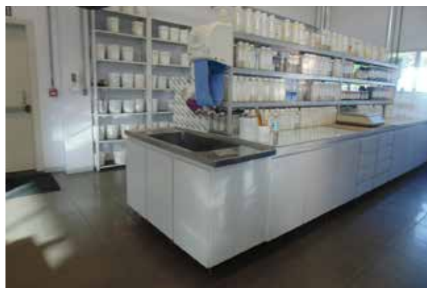
A View of Lab in TFL