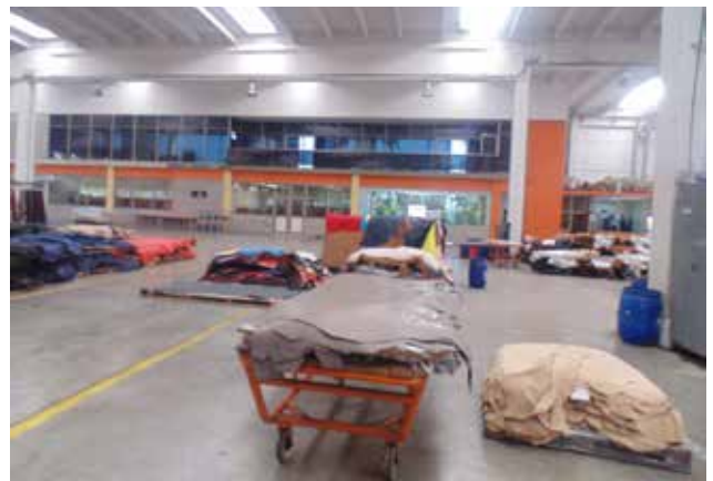
Delegates inspecting different kinds of leather at Arangia tannery