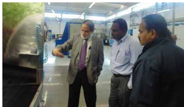
RC-CR explaining the process to ED, CLE & Consul-Commerical