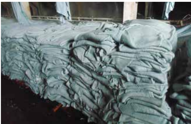
Wet blue kept for sale