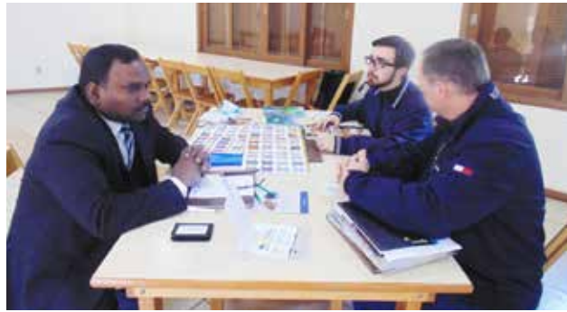
Executive Director, CLE interacting with the tanners in the B2B meeting