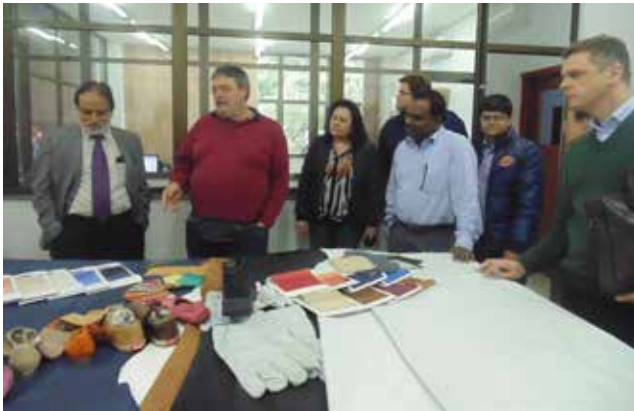
Delegates viewing the Finished product samples