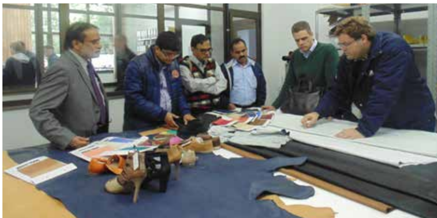
Delegates along with Consul-Commercial, CGI, Sao Paulo viewing the samples