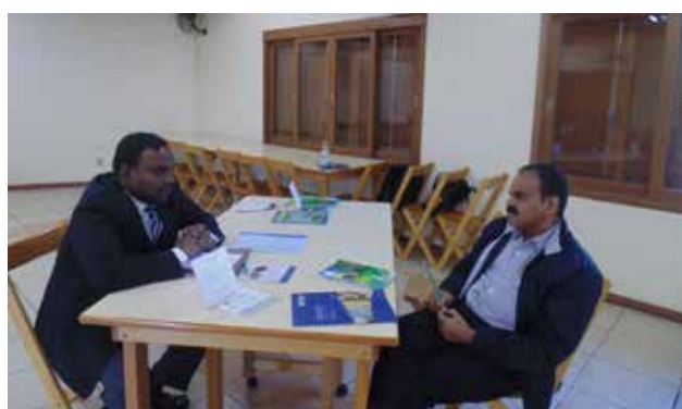
ED, CLE & Consul-Commercial, CGI, Sao Paulo interacting