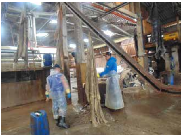
Raw hides being sent to the processing drums