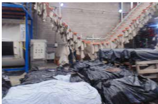
leather kept for drying