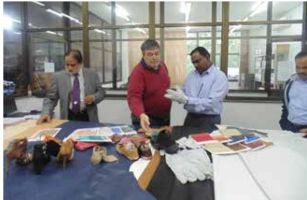
ED, CLE inspecting a sample