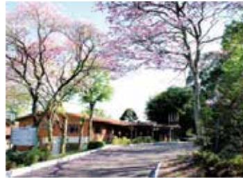
View of IBTEC

The delegates were then invited to visit the The Brazilian Institute of Leather Technology, Footwear and Artifacts (IBTeC)