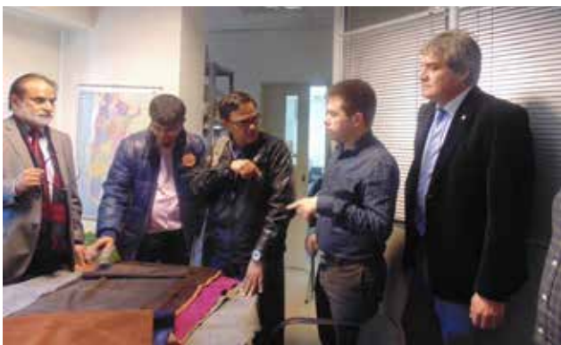
Delegation inspecting leather

Skinmax is specialized in premium quality leather manufacturing for exports. The company has a presence of over 30 years in the international markets and guarantees quality.