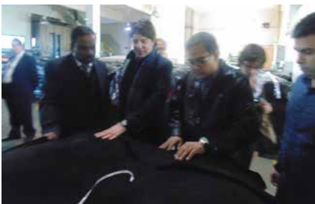
ED, CLE & Commercial Officer, EOI, Buenos Aires along with a delegate