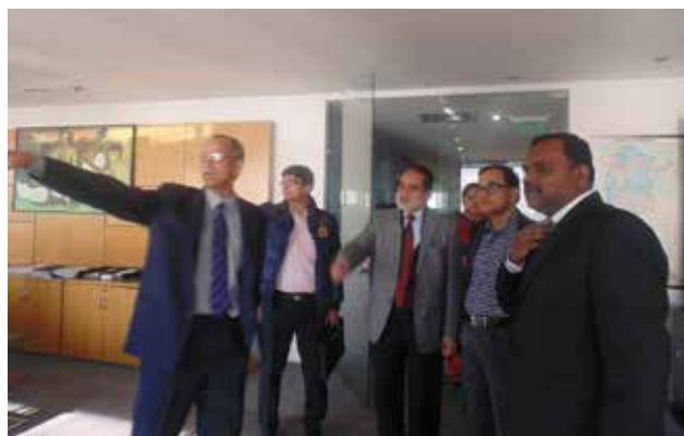
Ambassador showing the Uruguay port from his chamber office.

Concluding the meeting, the Executive Director thanked the Ambassador for all the support and assistance rendered by the Embassy in organizing a successful sourcing delegation to Argentina and also stated that as advised by the Ambassador, the suppliers from Argentina will be invited to India during the India International Leather Fair to have B2B meetings with the Indian tanners/manufacturers. The suggestion of setting up units in Argentina for processing the leather and then export to India as done by China will be taken up with the industry and appropriate decision will be taken in this regard.