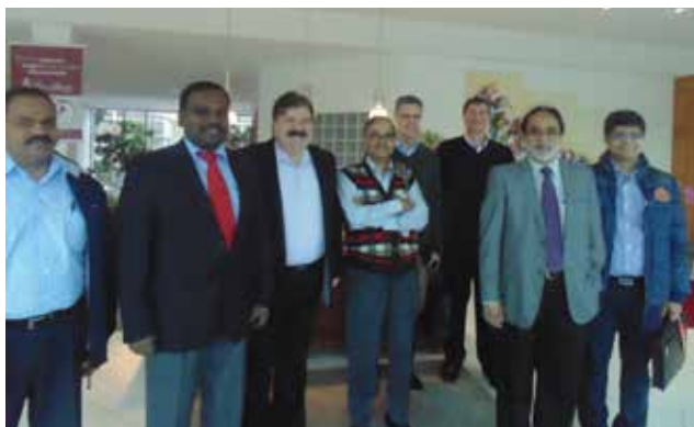
ED, CLE & the Delegates with the Euro America Logistics Company

Euro-America is the international freight forwarder specialised in leather transport in Brazil. In India, Euro America is operated by partnering with Taurus Forwarders Pvt Ltd and Transzone Logistics.