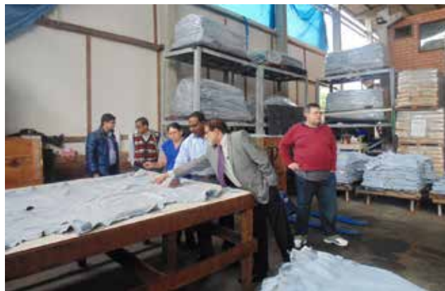
RC-CR & ED, CLE inspecting the leather