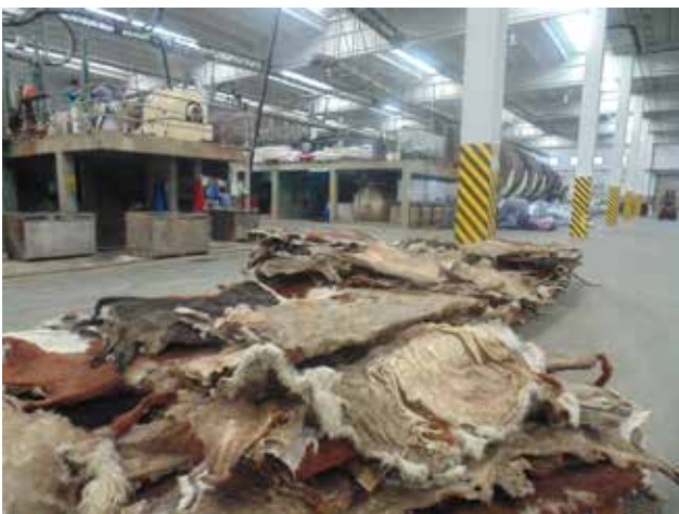
Raw hides in the tannery