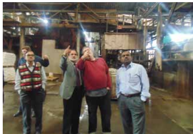
ED, CLE & the Indian delegates viewing the process