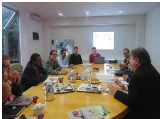
Presentation Meeting at Euro America

The details of the freight cost and the time taken for the delivery of the shipment to India by Euro America is as follows :