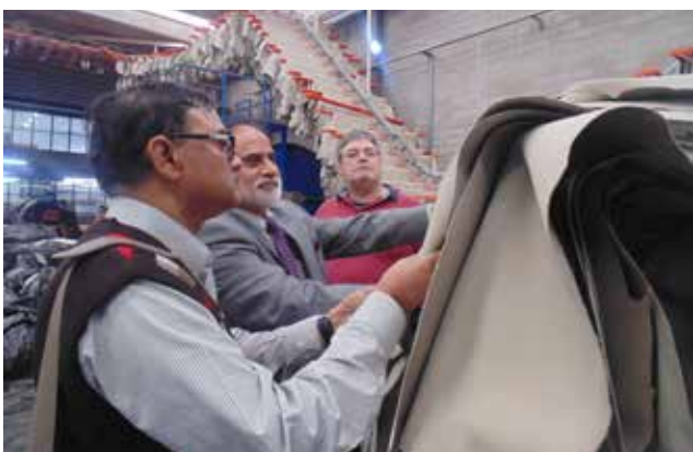
Delegates inspecting the leather