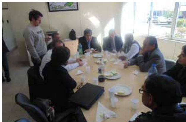
The delegation discussing with the tannery owner

The largest part of the production is focused on the footwear and pigmented printed leather and waterproof leather. The company is interested in selling wetblue and finished leather.