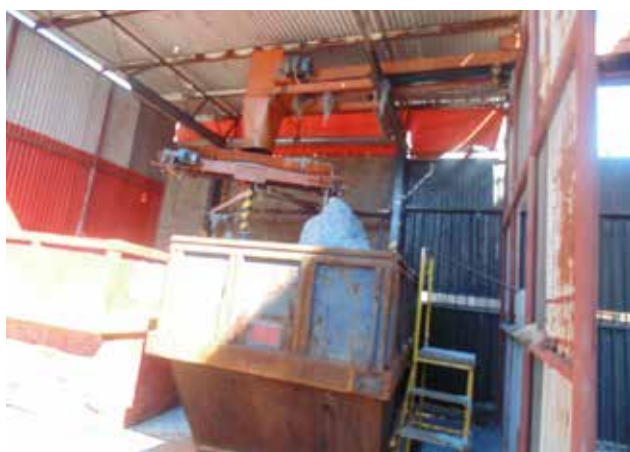
Collecting wastes from the tannery for exporting