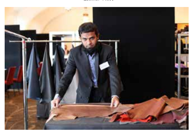
Al Furqan International