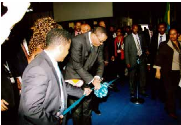
His Excellency Ato Hailemariam Desalgne, Prime Minister of the Federal Democratic Republic of Ethiopia inaugurating the Fair

After the inaugural function, the Prime Minister, HE Ato Hailemariam Desalgne visited the fair