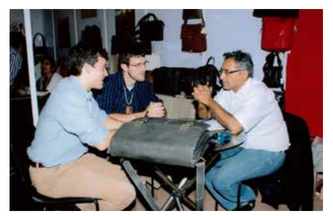
LEATHER NEWS INDIA April 2013 | 43

56 exhibitors covering various product groups of the leather sector, machineries, chemicals, components, service providers participated in this unique exhibition dedicated to the production and export of leather and leather products. There were 25 exhibitors from the leather goods segment with an area of 438 sqr mtrs.