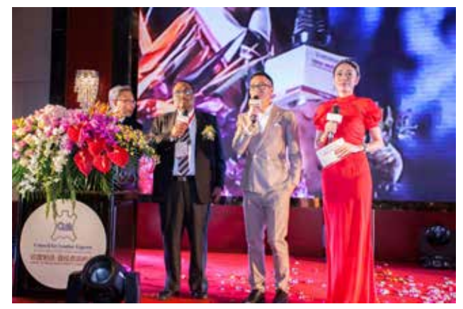
B2B Meetings between Indian and Chinese companies

A total of 8 Indian companies have given their interest to have joint venture collaborations with Chinese companies. The 8 companies are as under: