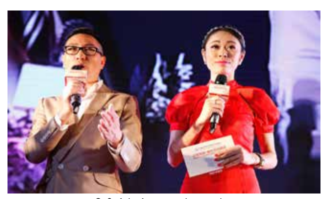
Q & A being moderated