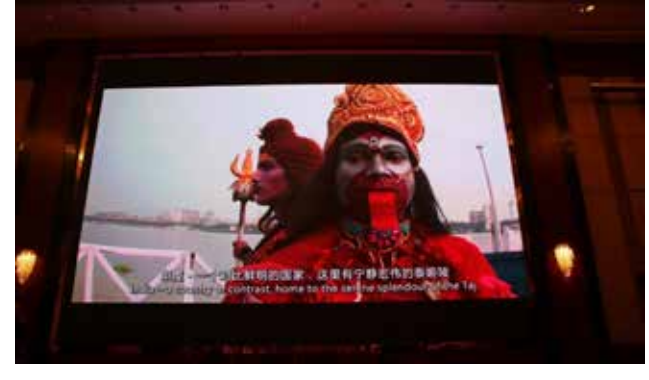
Video of India's Leather Industry being played