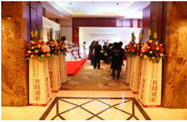
Each attendee received Make in India promotional material. Make in India: Leather Focus Sector brochures and leaflets promoting the leather specific sector, have been widely circulated during the Event.