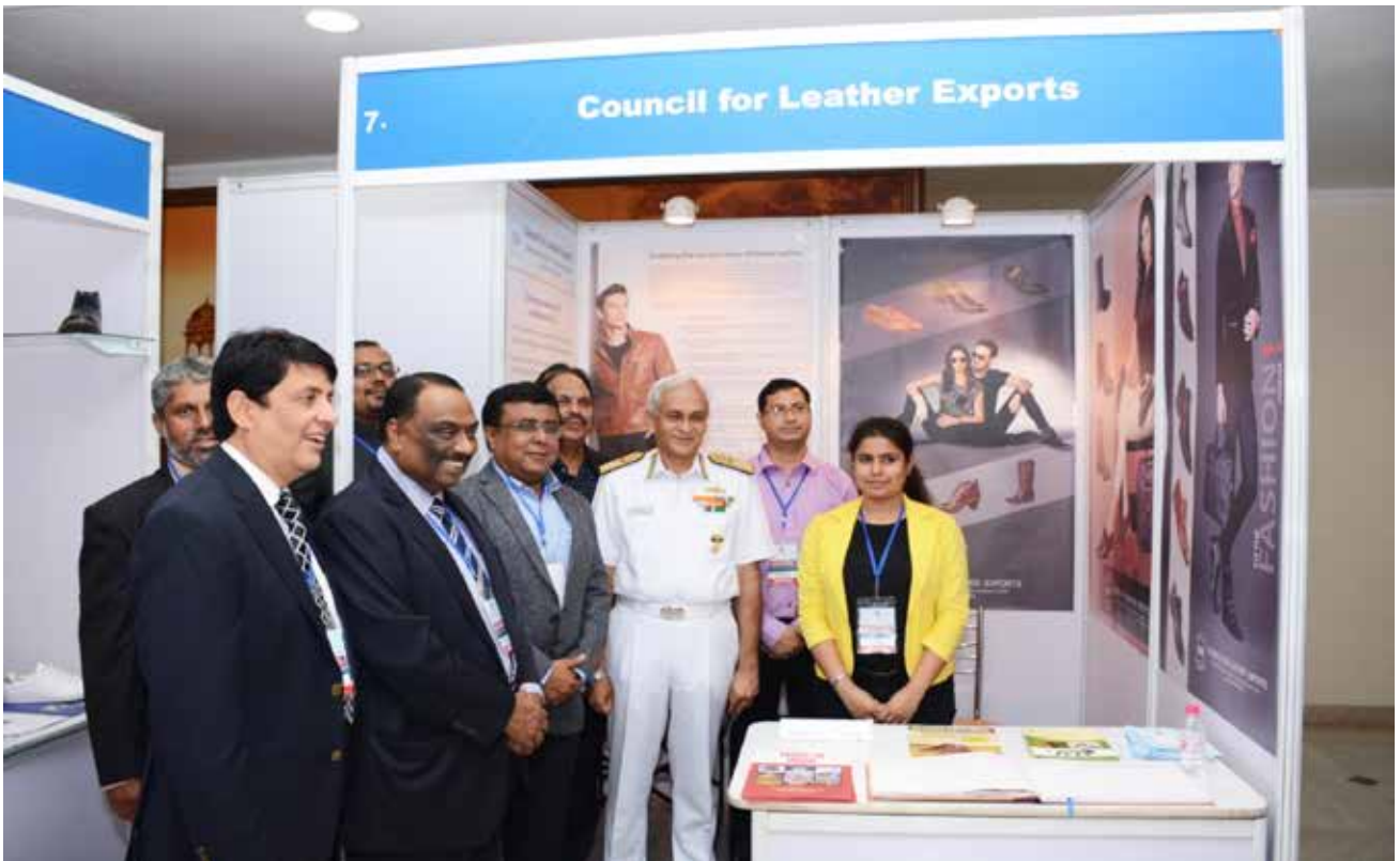
The dignitaries at the CLE booth