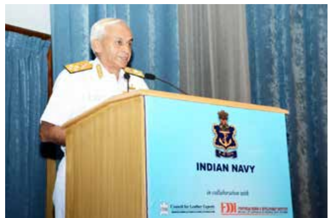
Admiral Sunil Lanba, PVSM, VSM, ADC, Chief of the Naval Staff interacting with the delegates of Footwear Industry and Indian Navy

Admiral Sunil Lanba, PVSM, VSM, ADC, Chief of the Naval Staff welcomed the dignitaries and other present in the auditorium. He conveyed that Indian Navy in collaboration with Council for Leather Exports and Footwear Design and Development Institute is organizing this Footwear Workshop-cum-Exhibition to solicit renewed cooperation with the industry. Military gives great significance to Uniform and therefore, footwear is an important part for them. Shoes not only protect at work but it also impacts our efficiency. Footwear is also one of the factors deciding the turnout moral and efficiency of a military men and women. George S. Patton has rightly quoted "Let's keep our boots polished, bayonets sharpened and present a picture of force and strength". The point of view is that Shoes are for safety, comfort and more importantly its functional ability to perform duty and task that a man or a woman is assigned to do and therefore it is essential to upgrade our footwear.