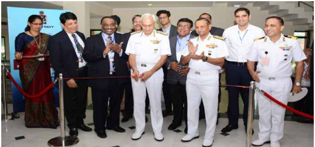
Admiral Sunil Lanba, PVSM, VSM, ADC, Chief of the Naval Staff inaugurating the exhibition

Admiral Sunil Lanba, PVSM, VSM, ADC, Chief of the Naval Staff alongwith other dignitaries inaugurated the Exhibition by ribbon cutting after which the dignitaries visited the stalls.