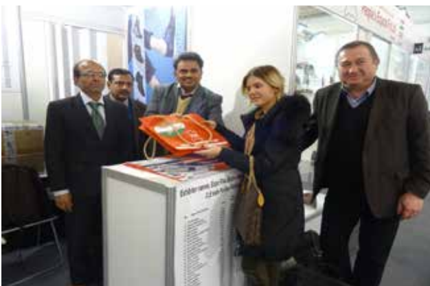
Trade visitors from Russian Federation collecting the publicity and promotional material from CLE stand.