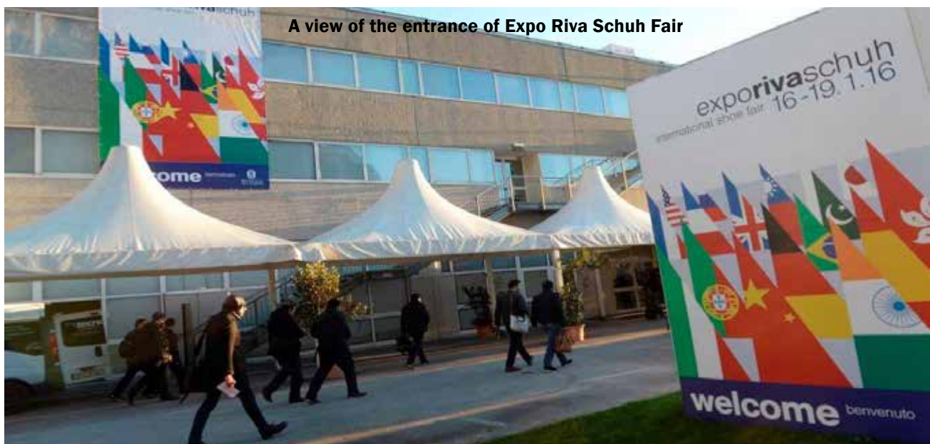
A view of the entrance of Expo Riva Schuh Fair

The 85th edition of Expo Riva Schuh was held in the valley of Riva Del Garda, Italy from 16-19th January 2016, launching the fair season for the footwear sector, and offering an advantageous observation point on the trends of the footwear market at global level. The international aspect has always been at the core of this event: a total numbers of 1,408 exhibitors presented their finest collections for Autumn/Winter 2016/17 in an area of 32500 sq.mt. It is pertinent to mention that 1,097 were overseas participants visited this edition from all over the world. There were a notable presence of groups of companies from the key footwear producing countries, such as India, China, Brazil, Turkey, Spain and Portugal.