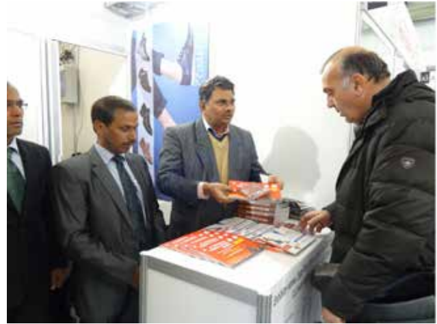
A trade visitor collecting promotional material at CLE information stand