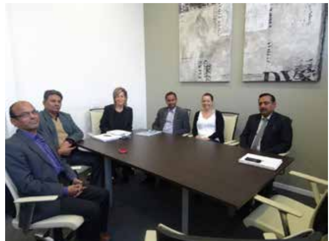
A view of Riva Del Congressi officials and CLE officials at the review meeting.