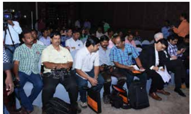
Journalists at the Press Meet