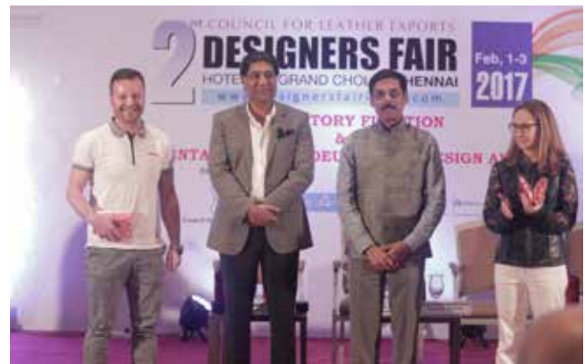
Designer from Portugal