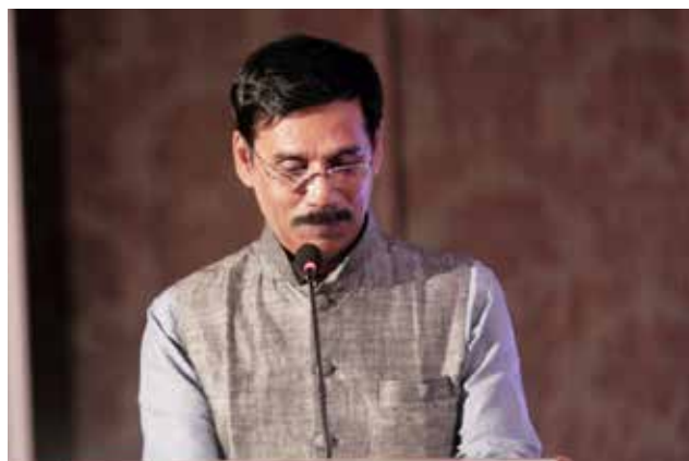
The Design Directors from USA and Europe also spoke at the occasion.