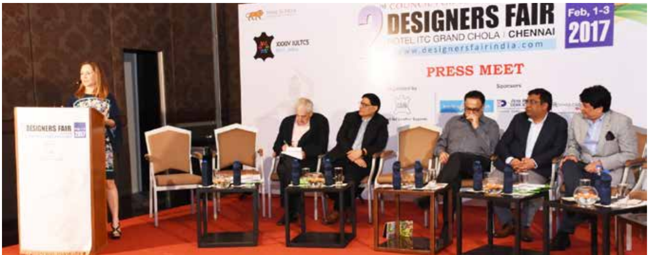
Dignitaries at the Introductory Meeting