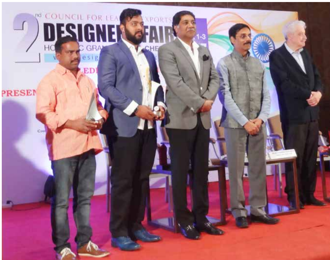
The Designers Fair has now become a regular feature in the global trade fair calendar for the leather industry. The Council will soon begin the preparations for the next edition scheduled at Feb. 1-3, 2018 in Chennai.