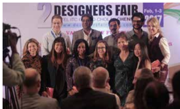
Designers from USA