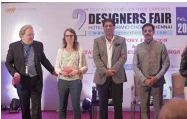
Designers from France