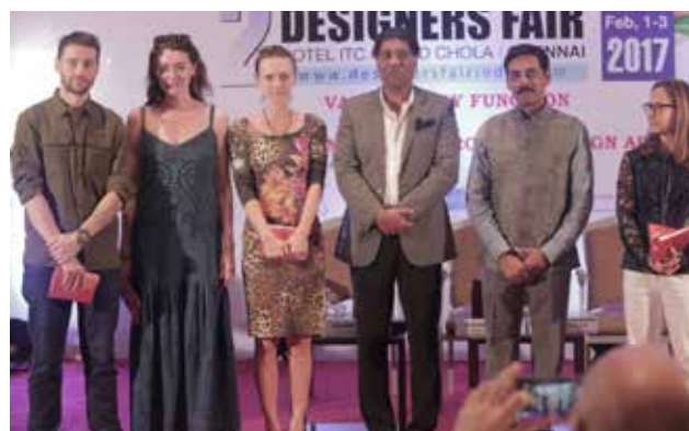
Designers from Russia