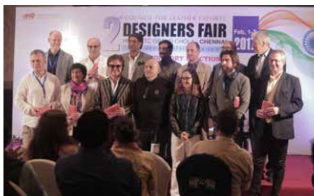
Designers from Italy