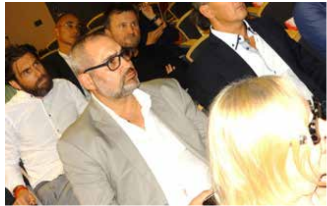
Designers Meet in Milan, Italy