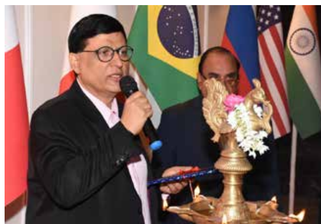
Shri Naresh Bhasin, Chairman, Task Force on Design speaking at inauguration