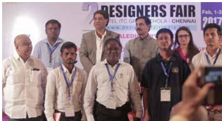
Designers/Institutions from India