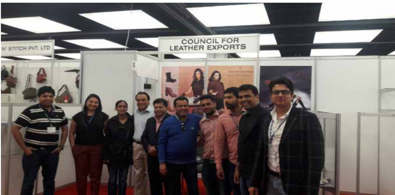
Member exporters and CLE representative at CLE India pavilion of BTS Poznan fair, Poznan, Poland.