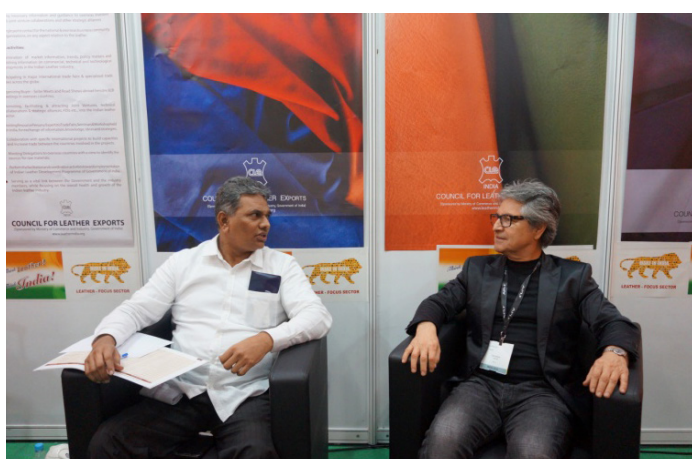
The editor of Modainpelle, Italy in CLE stand and discussing on Indian Leather Sector