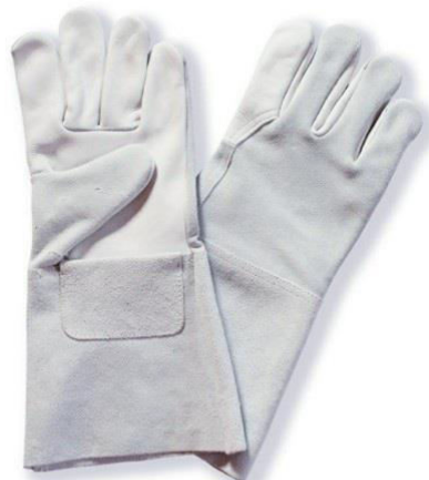
35 cm Welding Gloves