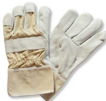
Cow Grain Canadian Gloves