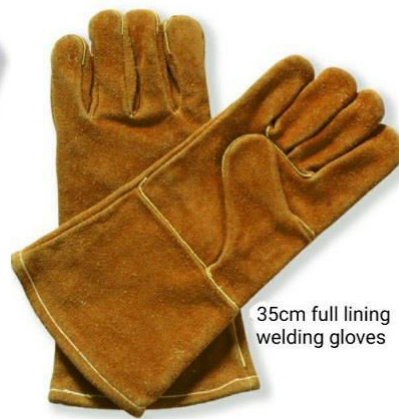
35cm full lining welding gloves