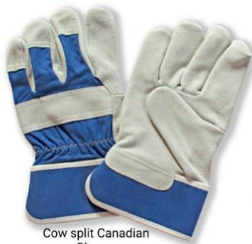
Cow split Canadian Gloves