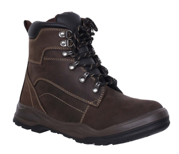
MODEL: BEN 36