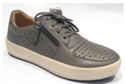
MODEL: DENIZE 03