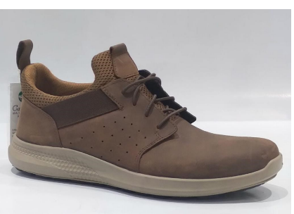
MODEL: KINLEY 05