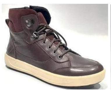
MODEL: DENIZE 13